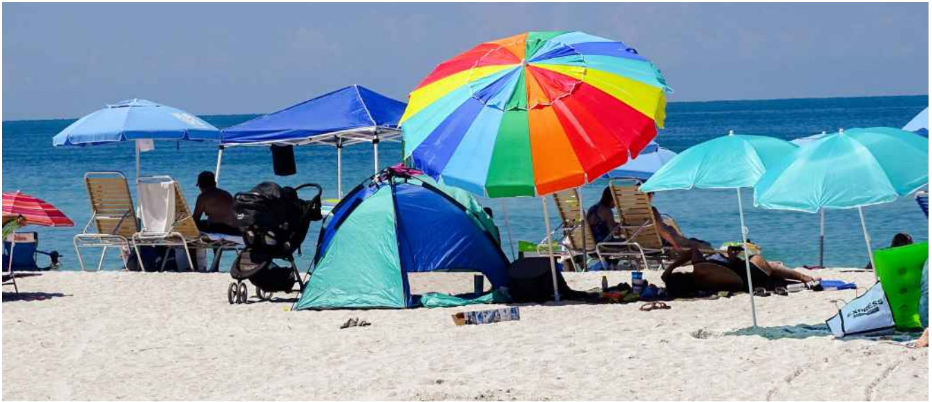
Bradenton Beach Scenic Highway