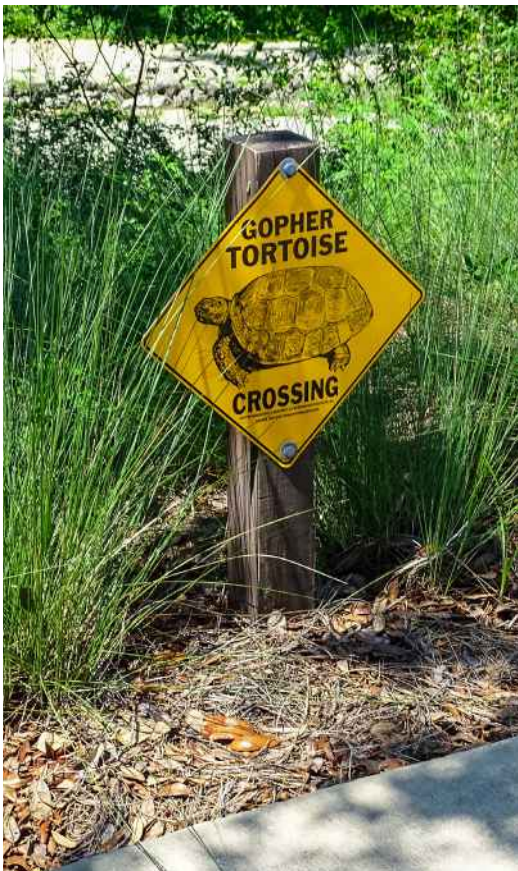
Green Mountain Scenic Highway