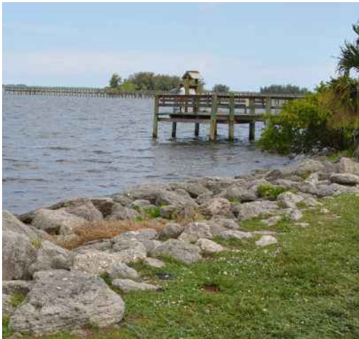
IRL Treasure Coast