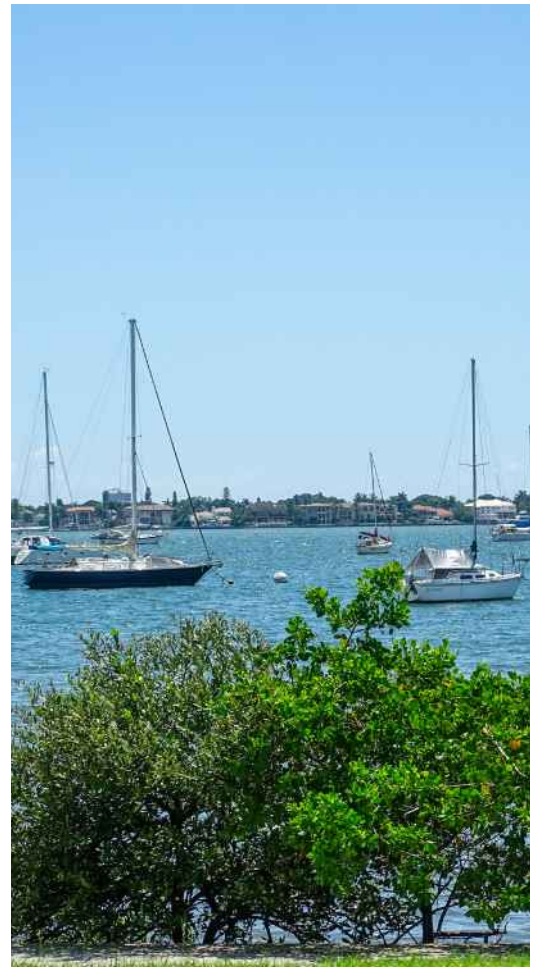
Tamiami Trail: Windows to the Gulf Coast Waters