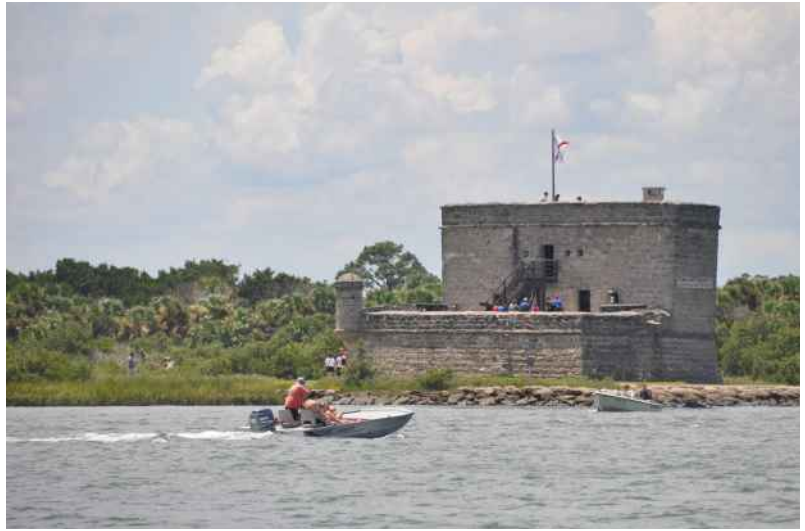
A1A Scenic and Historic Coastal Byway