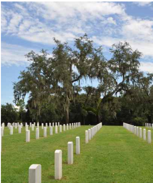
Scenic Sumter Heritage Byway