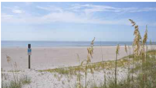
A1A Ocean Islands Trail (A1A OIT)