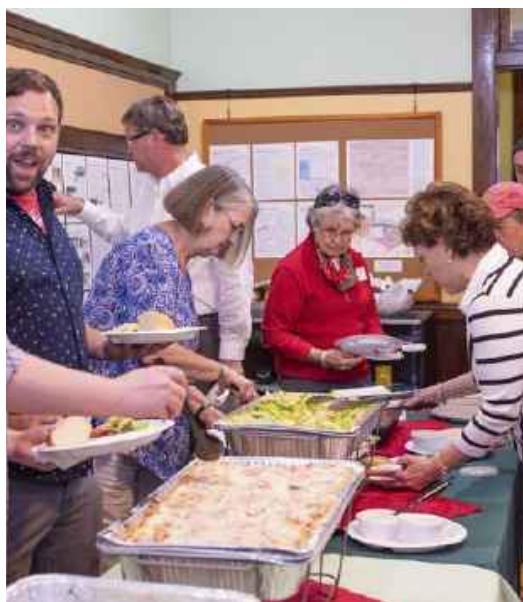
Dinner at Statewide Meeting (ROLHC)