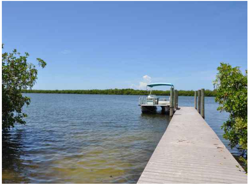
Lemon Bay / Mayakka Trail