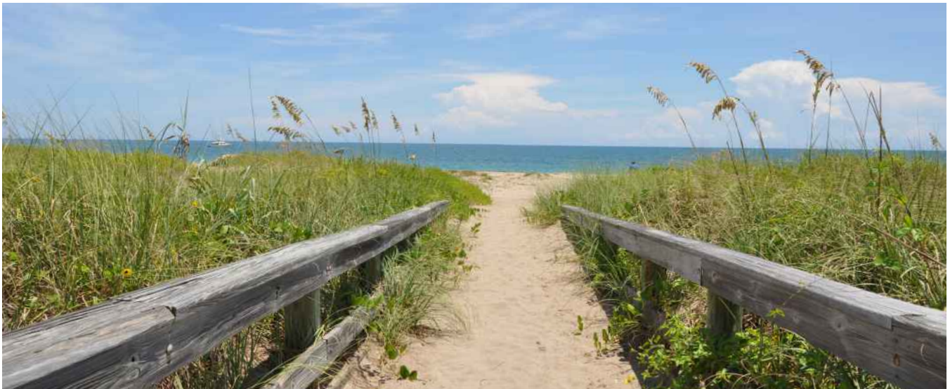
IRL Treasure Coast