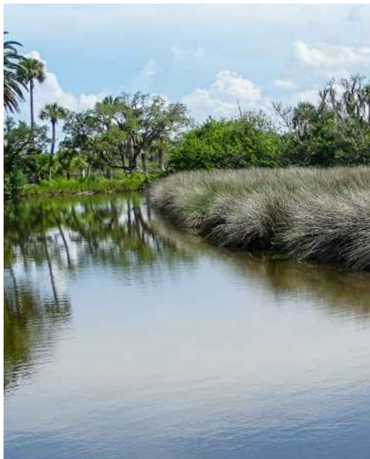
Ormond Scenic Loop & Trail