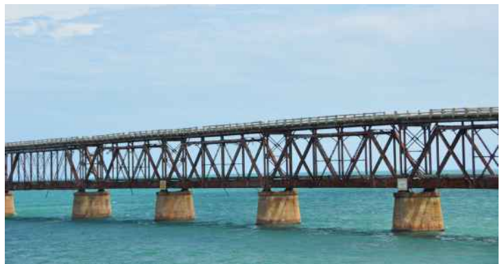
Florida Keys Scenic Highway - All-American Road

In November 2019, Byway Organization leaders and volunteers came together in DeBary, Florida to participate in the 2019 Statewide Meeting where the winner of the Garry Balogh Inspiring Excellence Award was presented. Lastly, the report features Byway Annual Report highlights from eighteen participating byways. We hope this document provides our readers with a meaningful look into the annual activities that have taken place at the national, state, and byway level.