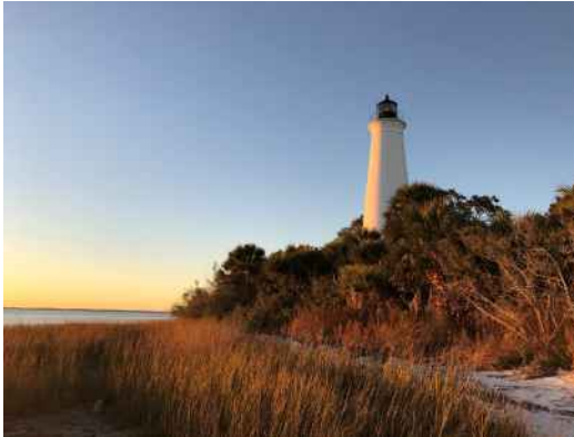
Big Bend Scenic Byway