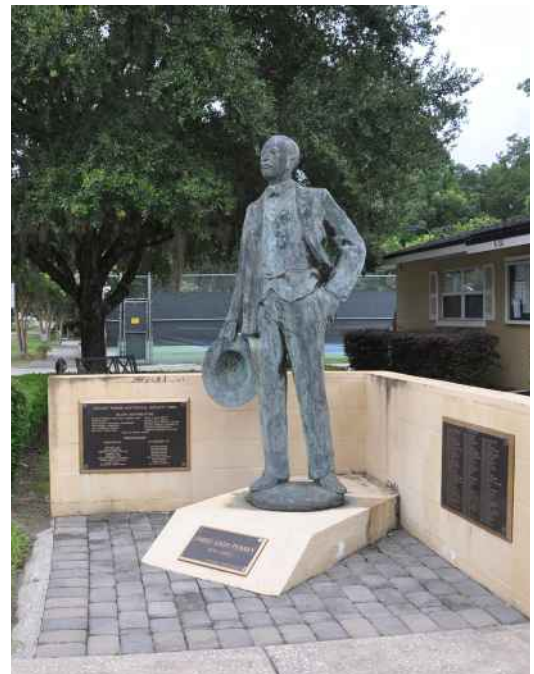
JC Penney Memorial Scenic Highway