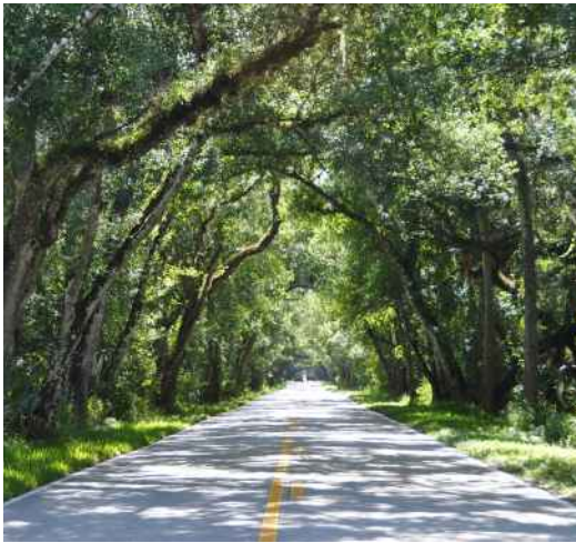
Martin Grade Scenic Highway