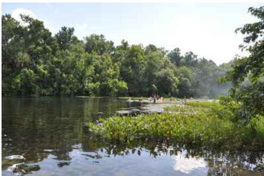
Florida Black Bear National Scenic

The Florida Scenic Highways Program was established in 1996 under the Florida Department of Transportation following the creation of the National Scenic Byway Program. As of 2019, Florida's collection was made up of twenty-six designated Florida Scenic Highways, six of which are National Scenic Byways, and one of these an All-American Road. The scenic corridors are supported by their local Byway Organizations and communities who put countless volunteer hours into promoting and protecting their scenic highways.