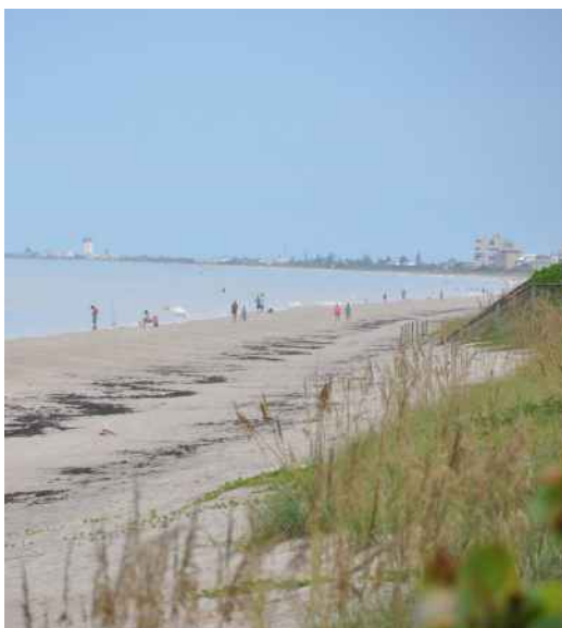
IRL National Scenic Byway