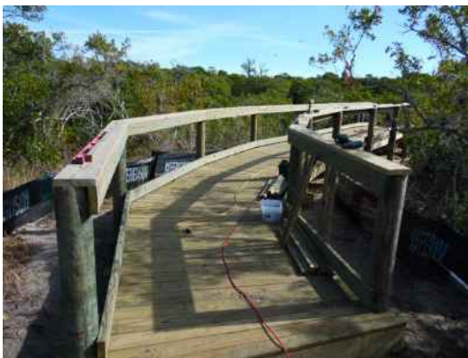
Palma Sola Scenic Highway (PSSH)