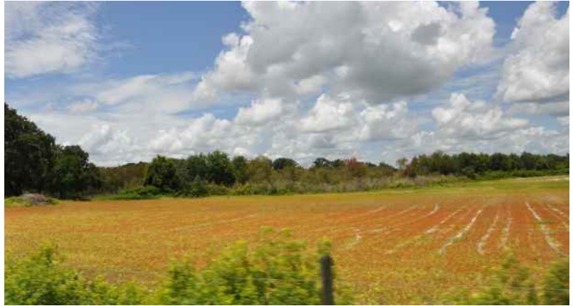
Scenic Sumter Heritage Byway