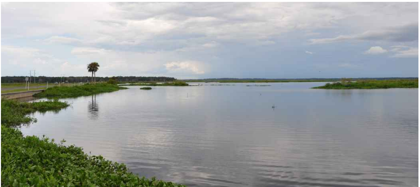
Old Florida Heritage Scenic Highway