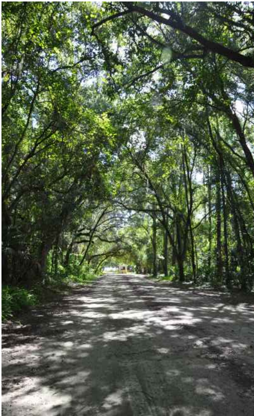
Florida Black Bear National Scenic Byway