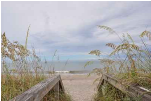
Indian River Lagoon National Scenic