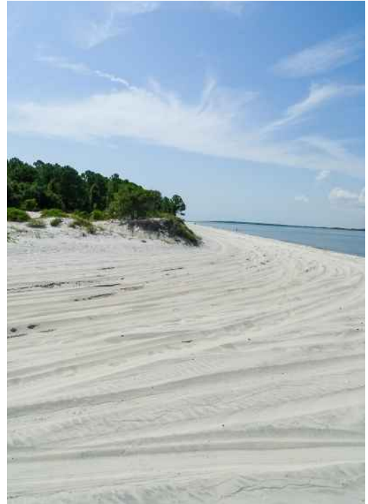
A1A Ocean Islands Trail