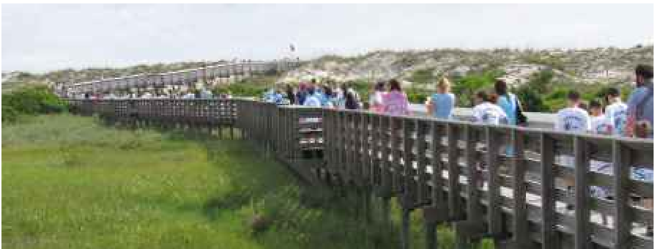
Kids Camp (A1A S&HCB)