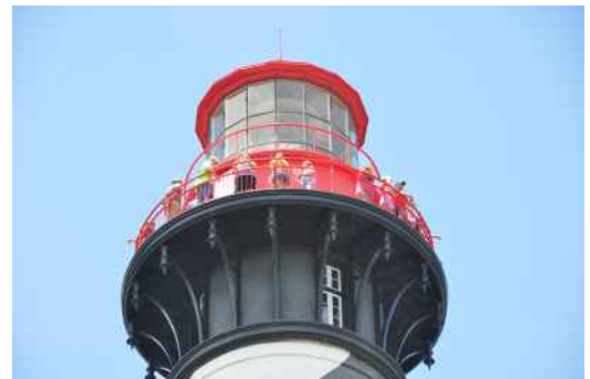
A1A Scenic & Historic Coastal Byway