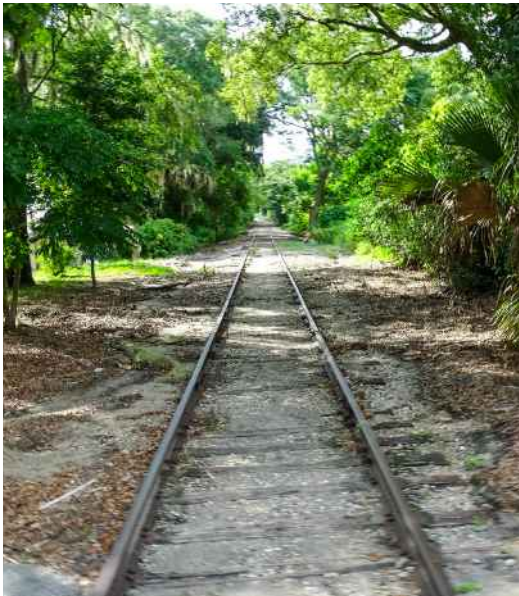
Green Mountain Scenic Highway