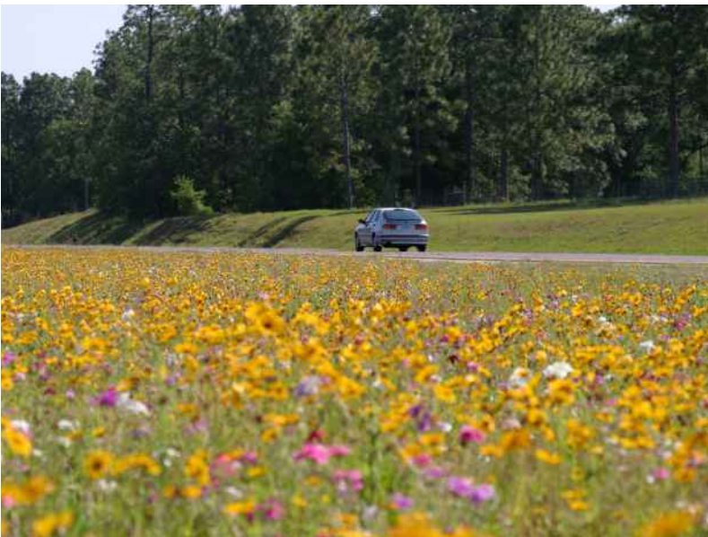
Suncoast Scenic Parkway