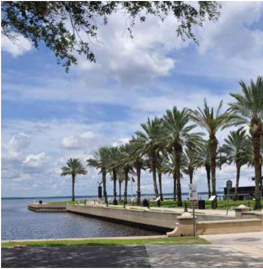
River of Lakes Heritage Byway