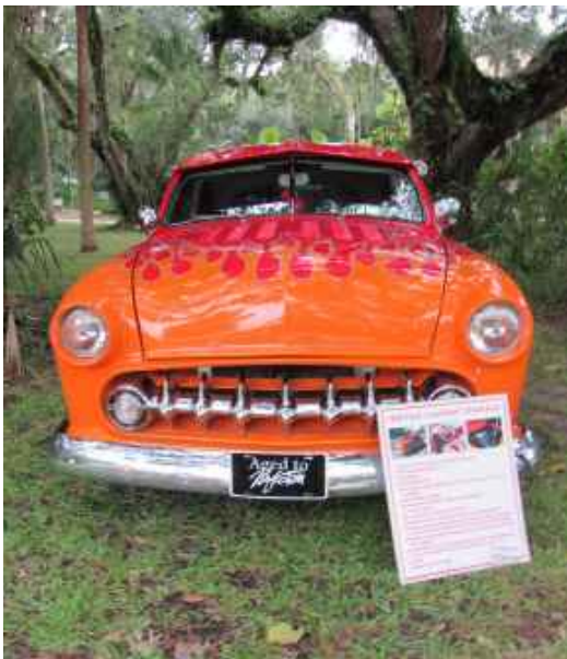
Annual Garage Sale (A1A S&HCB)