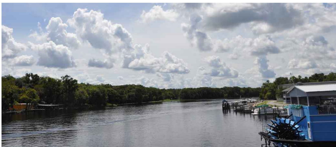
River of Lakes Heritage Corridor