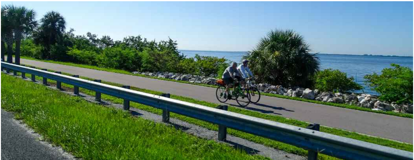
Courtney Campbell Causeway