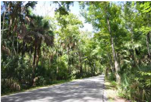
Ormond Scenic Loop and Trail