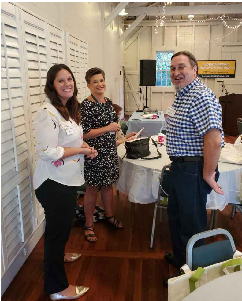
2019 FSHP Statewide Meeting