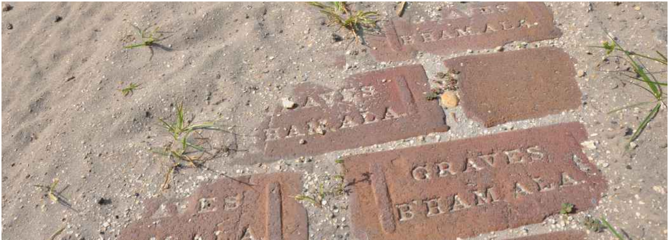
Heritage Crossroads: Miles of History