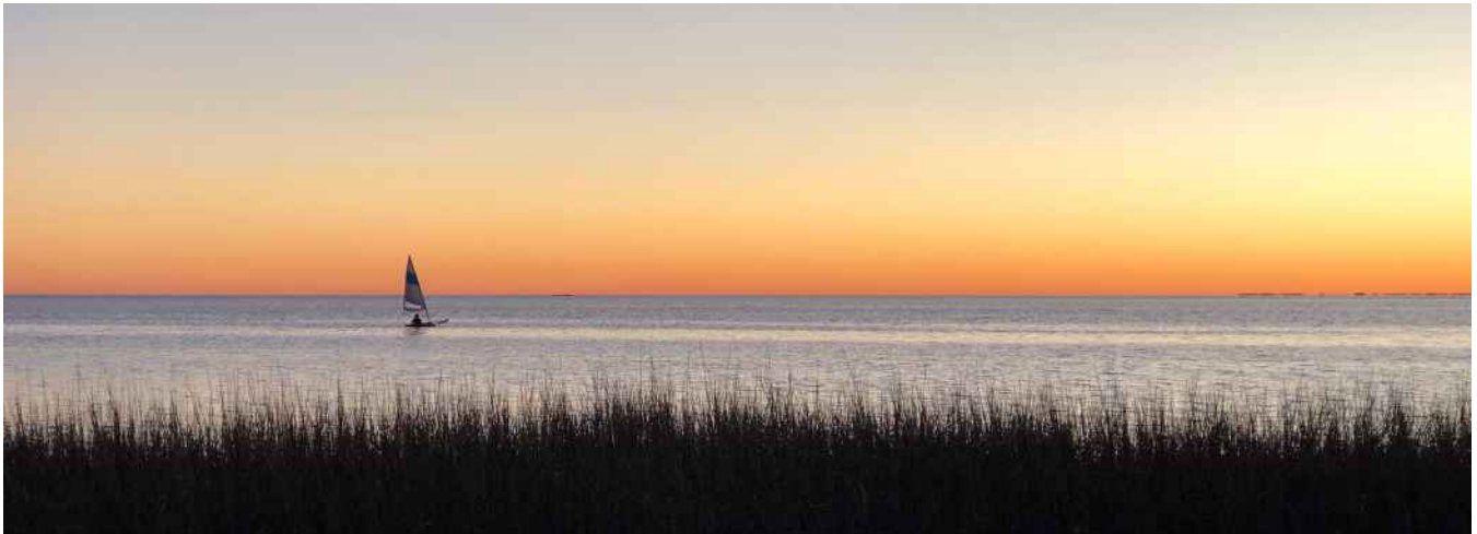
Big Bend Scenic Byway