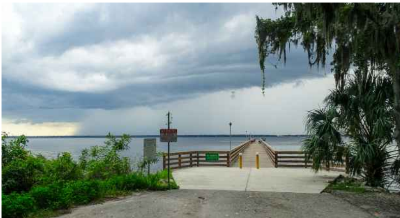
William Bartram Scenic & Historic Highway

In 2019, the Florida Scenic Highway Program purchased a membership with the National Scenic Byway Foundation . By obtaining this membership, Byway Organization leaders and District Scenic Highway Coordinators have access to training materials, while the scenic highways themselves receive national promotion through the Foundation's marketing campaign.