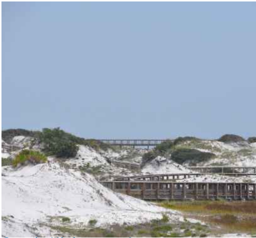
Scenic Highway 30A