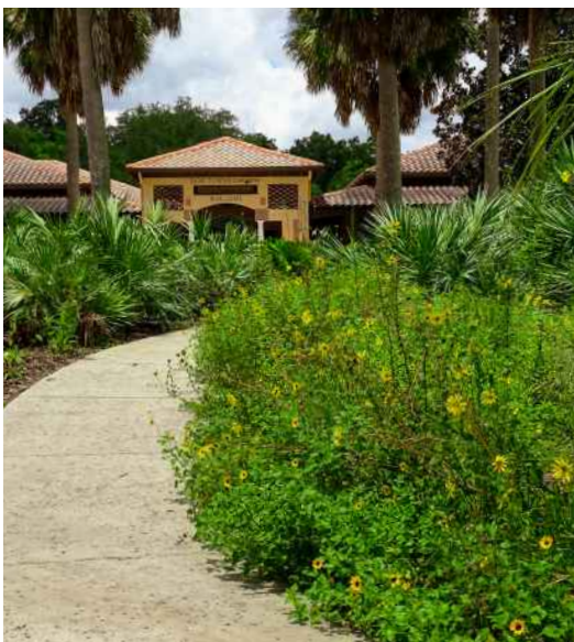
The Ridge Scenic Highway