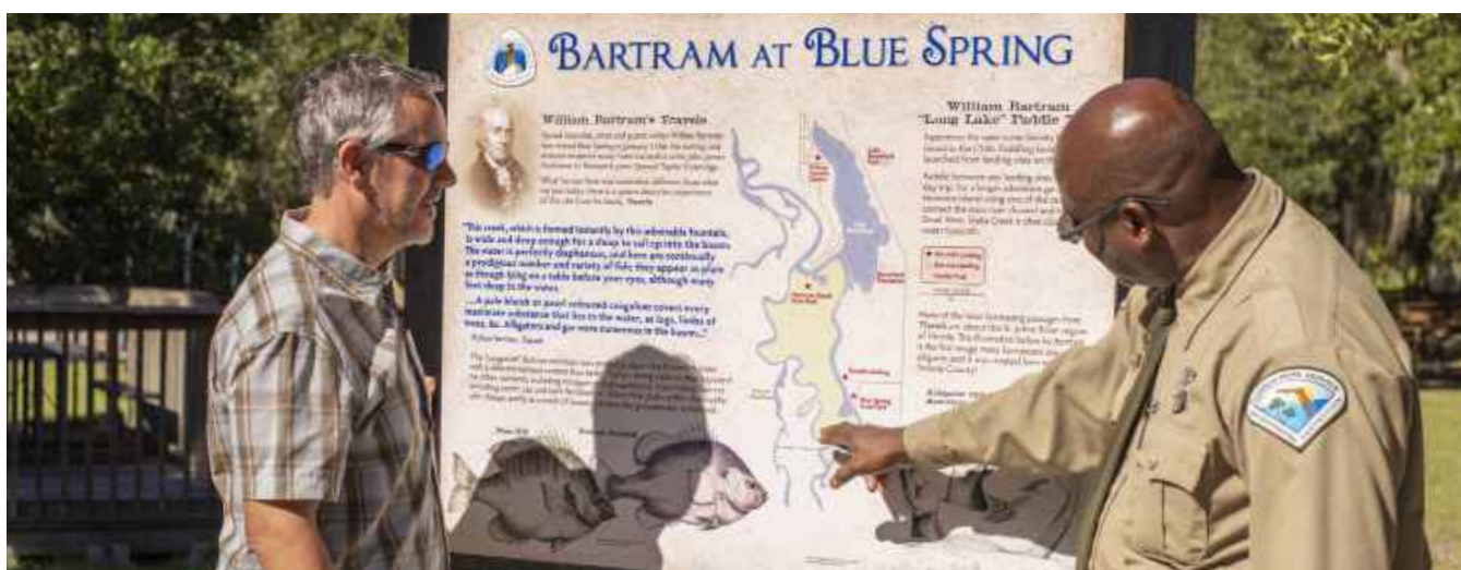
New Interpretive Signage (ROLHC)