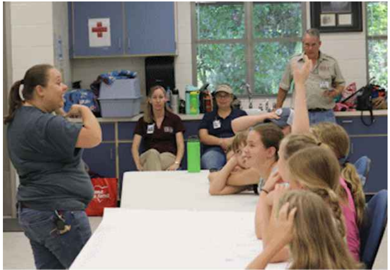
Summer Camp (FBBNSB)