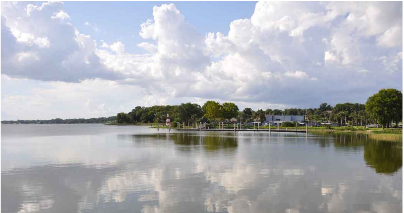
Green Mountain Scenic Byway