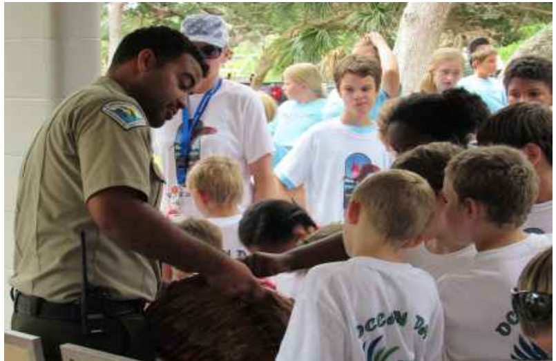
Kids Camp (A1A S&HCB)