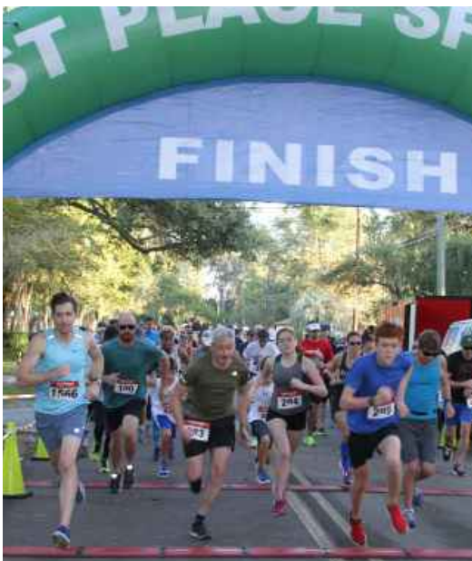
5k Race (JCPSH)