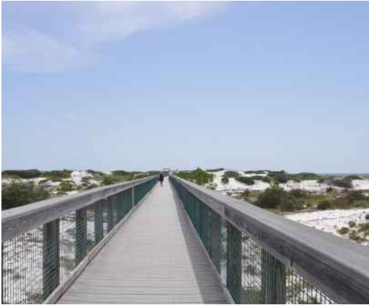
Scenic Highway 30A