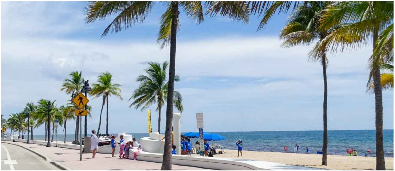
Broward County A1A Scenic Highway

Information on the following pages was gathered from a review of Byway Annual Reports that were submitted for 2019. A total of 18 BARs were submitted: