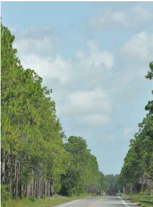
Big Bend Scenic Byway