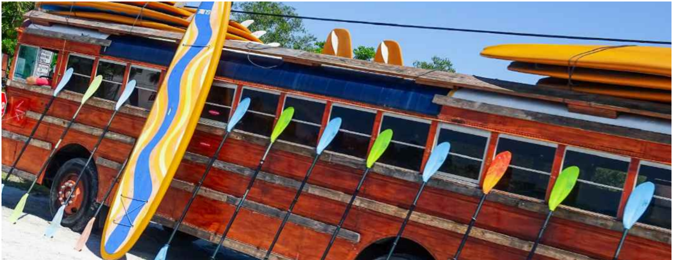
Palma Sola Scenic Highway