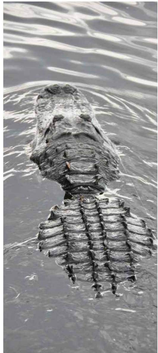
Old Florida Heritage Highway

In September 2019, President Trump signed into law the Reviving America's Scenic Byway Act of 2019. The law re-opened the federal Scenic Byway Program to accept nominations for roads to be designated as National Scenic Byways or All-American Roads.