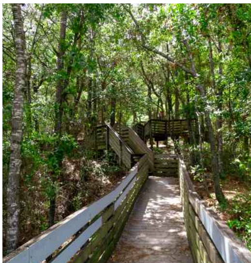
Pensacola Scenic Bluffs